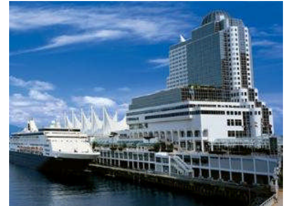
A fair prospect for dispute settlement

With the consent of the parties, a binding decision is made within 28 days adopting procedures used most successfully in the U.K. construction industry.